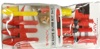
SCRAPE-BURR KIT 3 + 1