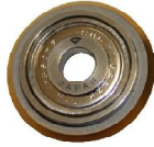
No. 22X Titanium Coated Tungsten Carbide Rotary Bearing Wheel O.D. : 22mm