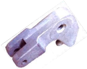
Wheel holder for JP Tile Cutter No. 22X wheel